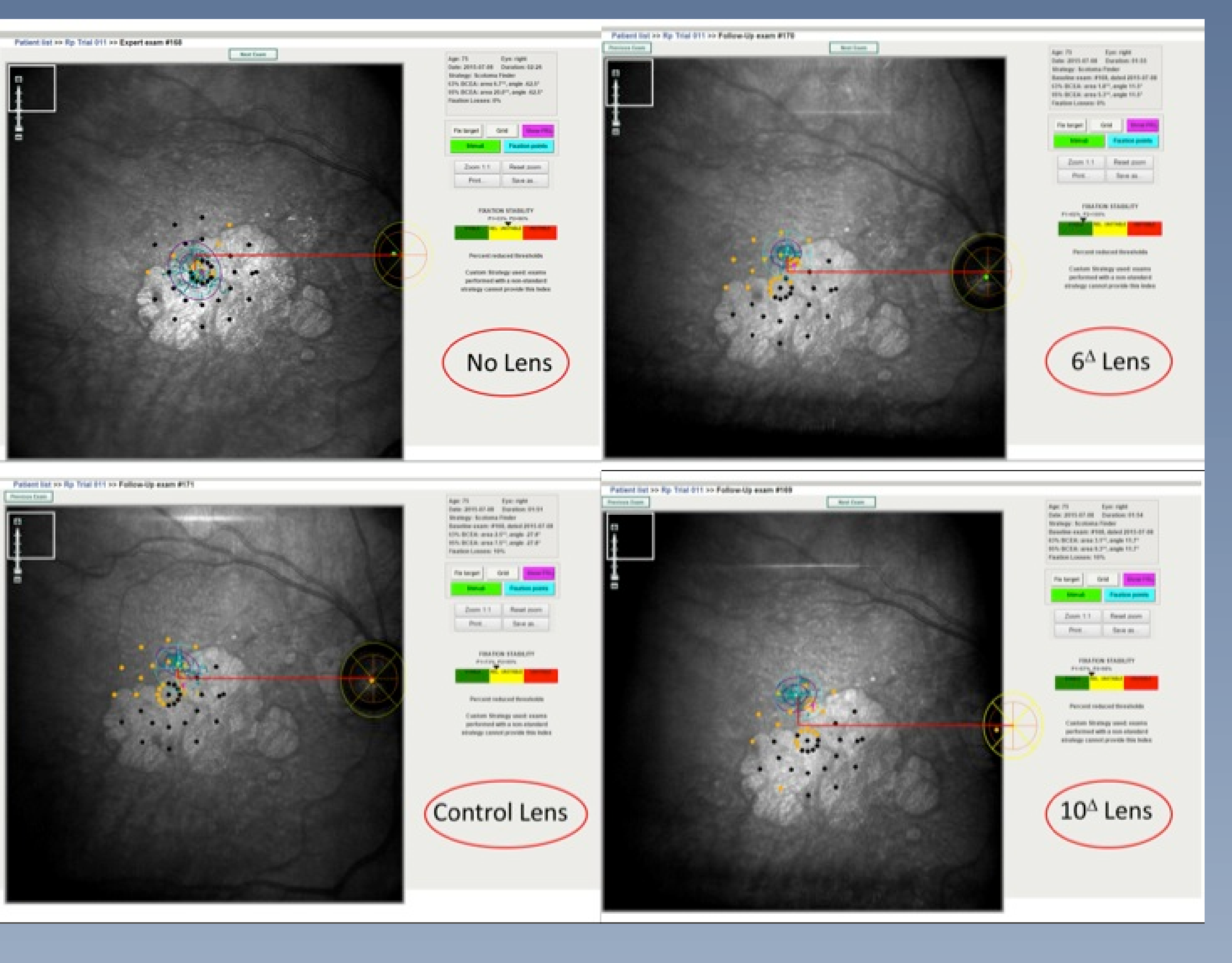
Figure 1. Using PowerPoint to measure the PRL relative to the center of the optic disk. Upper left measurement is with no lens; upper right is with 6<sup>Δ</sup> base-up; lower left is with the control lens; lower right is with 10<sup>Δ</sup> base-up. See text for details.

We assessed the PRL in 13 low vision subjects with central scotoma under four conditions: No lens, a lens with no prism ("control lens"), 6^{\Delta} base-up, and 10^{\Delta} base-up. The PRL was evaluated using the MAIA scanning laser microperimeter with no lens, and then with each of the three lenses in a randomized sequence. The PRL was determined in degrees in horizontal and vertical coordinates from the center of the optic disk using a graphical analysis.